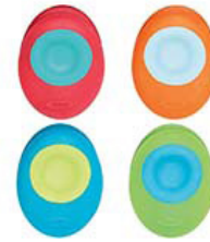
4 magnetic clips